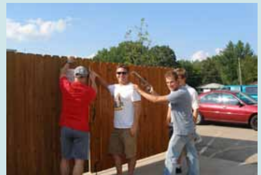
Bethesda-(Blues Brothers) and YWAM-(Hack saw) teams having fun with their service projects!