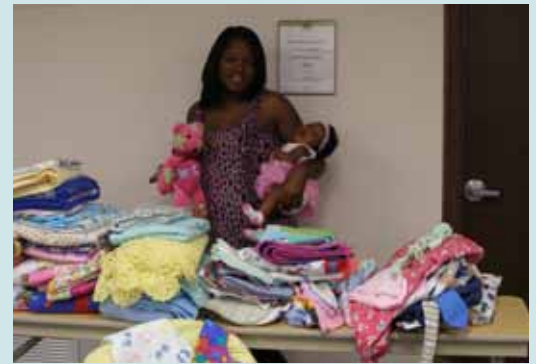
A resident and her daughter representing The Elizabeth House at a presentation for the Middleton Senior Center; the women there made all the baby gifts in the photo.