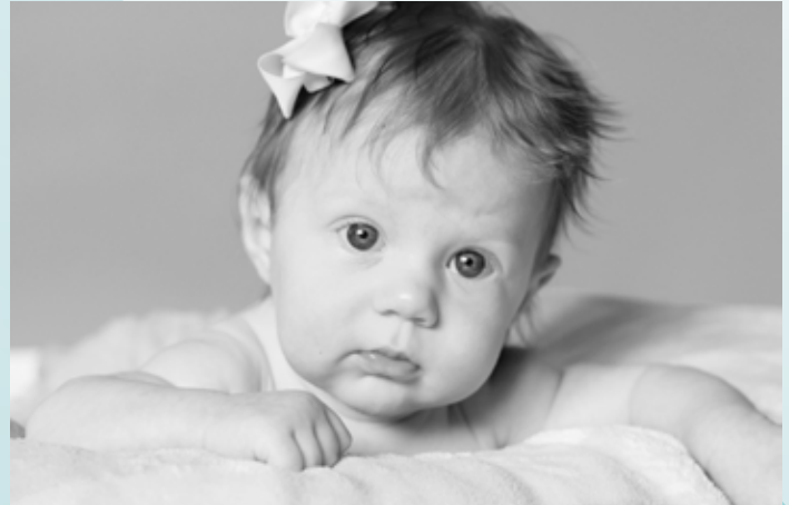
"God's Special Delivery"

"But when I saw the ultrasound and heard the heart beat, that