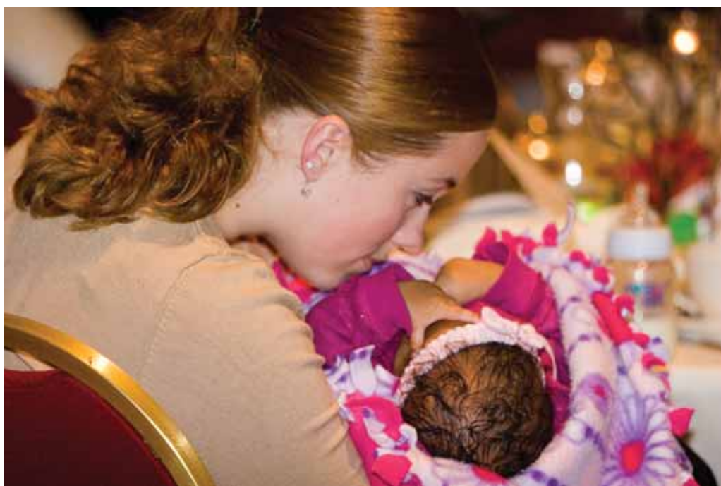
Mom and baby from The Elizabeth House at 2006 banquet