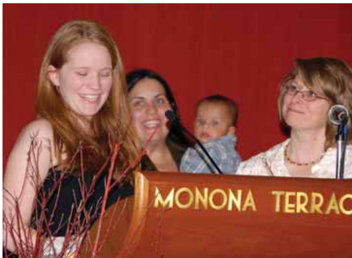
Celebrating life with stories