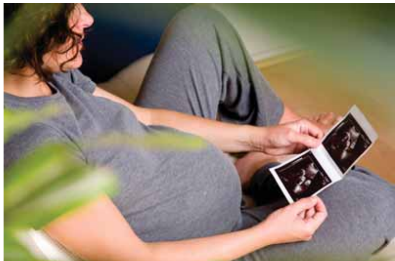
Older clients face different challenges

Regardless of her age, all of these expectant moms need our prayers. We do our best to follow up with every client. Sometimes that's impossible because clients move, change their phone numbers or email addresses. But your prayers are the best follow up. Through our great God and your prayers, lives will be changed.