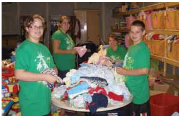
Crosspoint Church Volunteers