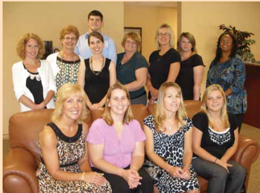
Visitors from other pregnancy centers and Care Net staff