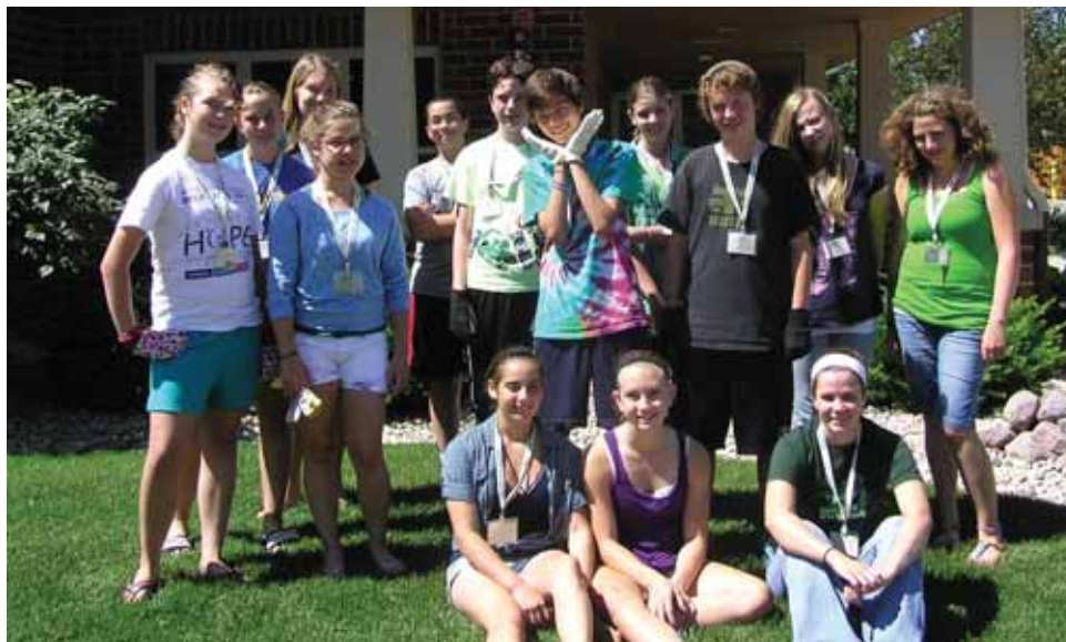
Volunteers from Madison Mission

Those who recently heard or will soon hear a message from Care Net include: