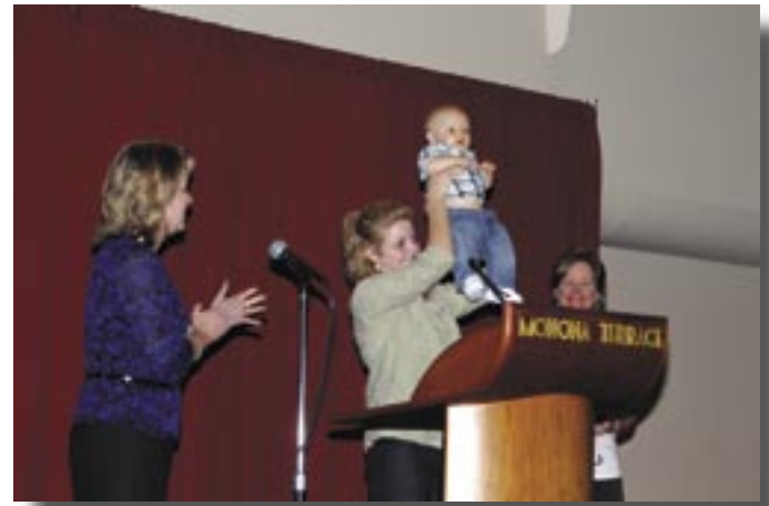
Past client with her child at banquet