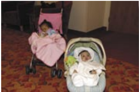
Babies from The Elizabeth House attending the banquet

Nearly 350 people, representing about 50 area churches, gathered at the Monona Terrace on Thursday, November 6, for this event. Banquet guests witnessed the debut of our new award-winning "Heartbeats of Hope" DVD and heard and saw firsthand how God has worked through Care Net in the lives of former clients and their families.