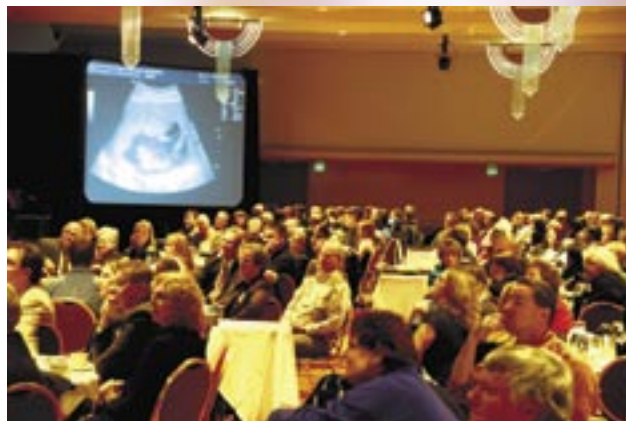
Guests view a live ultrasound

Care Net’s Annual Fundraising Banquet offers a great opportunity to introduce people to Care Net’s work who may wonder how they could be engaged in this battle and who may quietly desire to “do something” about the abortion crisis in our nation.