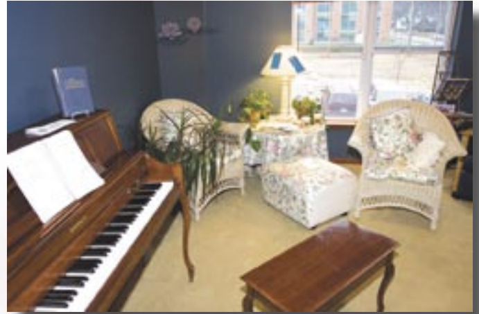
Reading Room at TEH