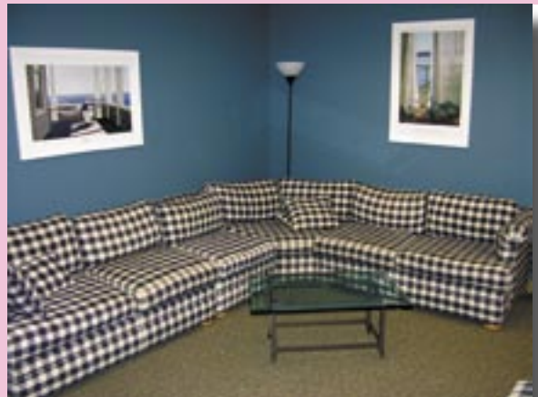
Whole Heart Counseling Room