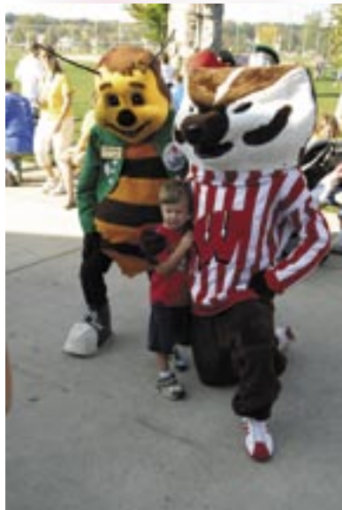
Bucky and Friends

The day of the walk was a gorgeous sunny day with mascots, including Bucky Badger, running around. Mascots appearing at Walk for Life 2007 were Bucky Badger, Wolfie, Maynard G. Mallard, Scoopie, Crash Helmet, Red Robin, OCBee, Happy Heart,