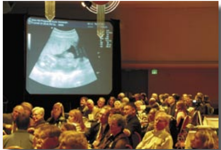
Ultrasound viewed by banquet guests