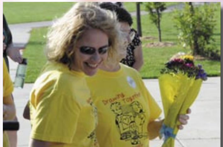
Walkers enjoying the day

could support women, children and families at The Elizabeth House.