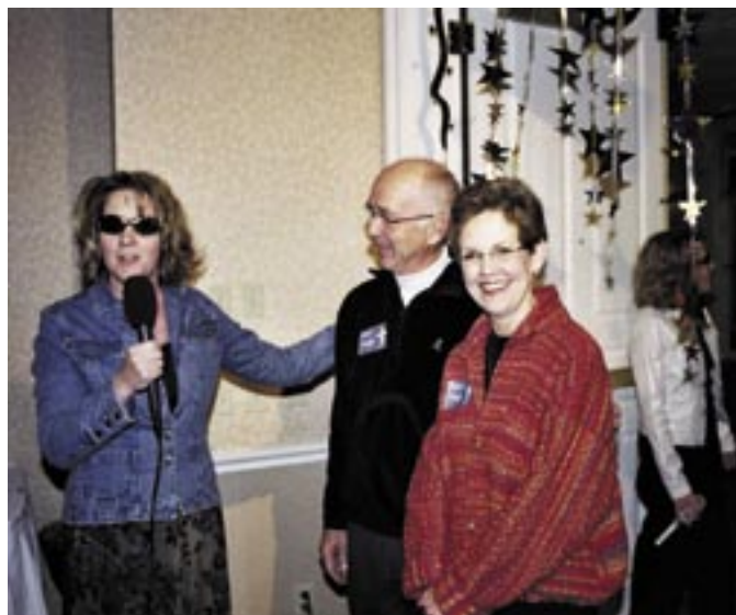
"Joan Rivers" addresses another Star

Lives have been changed because someone answered the Careline, helped prepare a mailing, befriended a resident or client, organized a fundraiser, or used their medical training to assist a client...(there are too many ways for all of them to be listed). Many have been blessed, and will be blessed